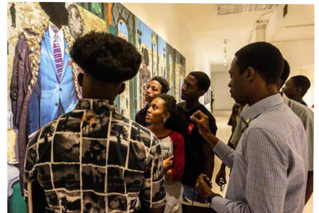
Visit of the National Gallery of Jamaica, 2018