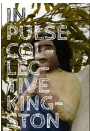
InPulse Collective - Kingston, 2018