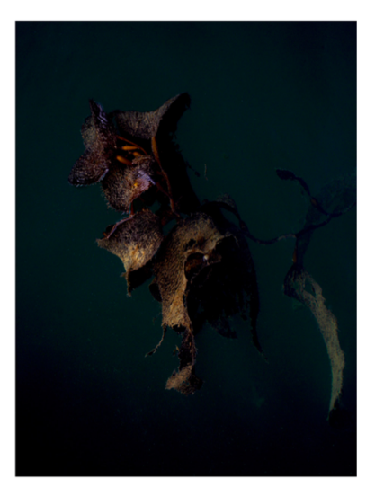
Images from the series Behold the Ocean (2020), Macrocystis pyrifera [ Patagonia ]