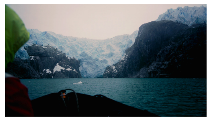
Images from the series Behold the Ocean (2020), Point In Time [Santa Inés Glacier, Seno Ballena]