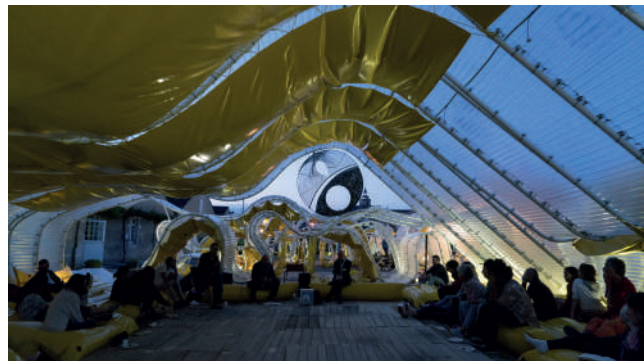
➤ La Nuit des Rêves © Marc Damage