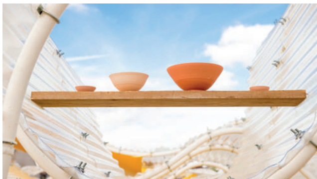
➤ Parcours de Sens , Manon Clouzeau