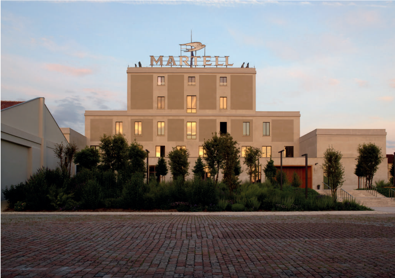
↗ © Marc Damage