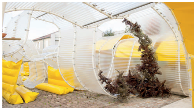
➤ Epiphyte , L'Oseraie de l'Île