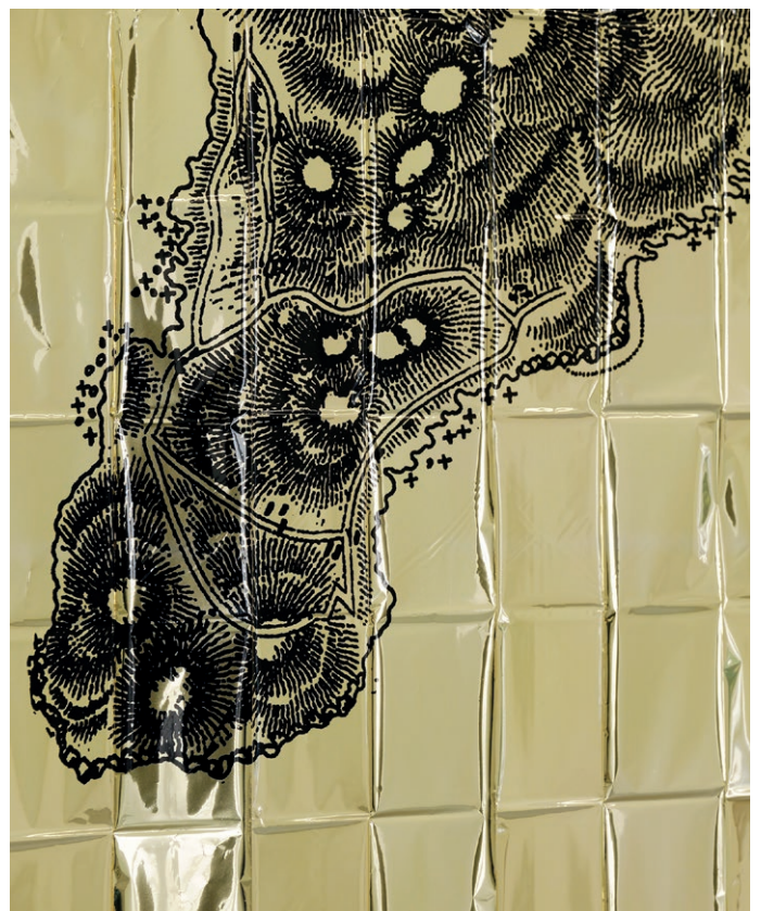
Benoît Billotte Isulae (detail), 2015 5 silk-screen prints on survival blanket, 160 x 210 cm Courtesy of the artist - production centre d'art contemporain La Villa du Parc, Annemasse Photo credit © Aurélien Mole