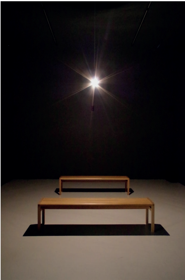
Philippe Lepeut C'EST DU VENT , 2015 Sound installation for 5 loudspeakers, 2 facing benches and a light bulb, variable dimension Courtesy of the artist Photo credit : Marynet Jeannerod