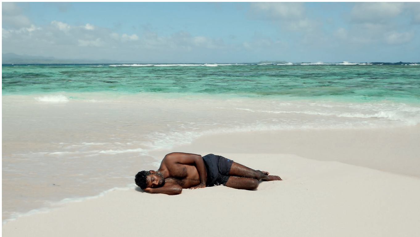
Hoda Afshar Remain , 2018 Two-channel digital video, colour, sound, 23 min. 29 Courtesy of the artist and of the Milani Gallery © Hoda Afshar, Milani Gallery.