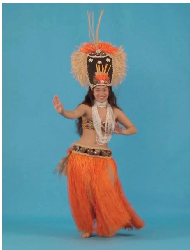
Charles Fréger, Blue Heaven , 2012, Installation of 6 videos.