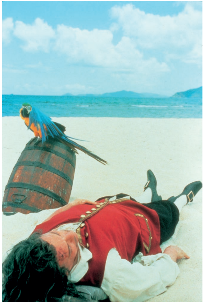
Rodney Graham Vexation Island , 1997 FNAC 980836 Centre national des arts plastiques © Rodney Graham / Cnap / Photo credit: courtesy Lisson Gallery