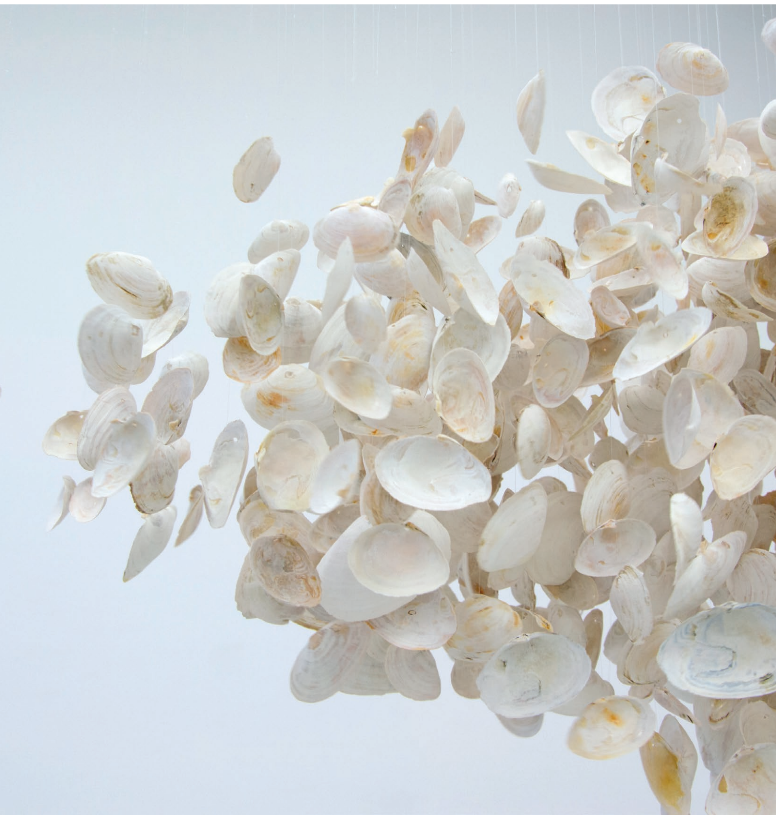
Stéphane Clor Imaginary Soundscape (detail), 2016 Sound installation, mixed media, motors, speakers, programming, field recordings Courtesy of the artist © Photo credit : Stéphane Clor