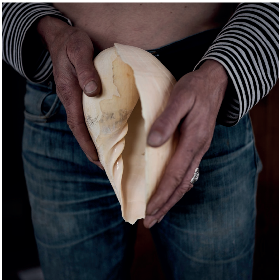
Yohanne Lamoulère L'île (extract) , 2020 Photographies, 5×(60×60), 13×(40×40), 13×(30×30) cm