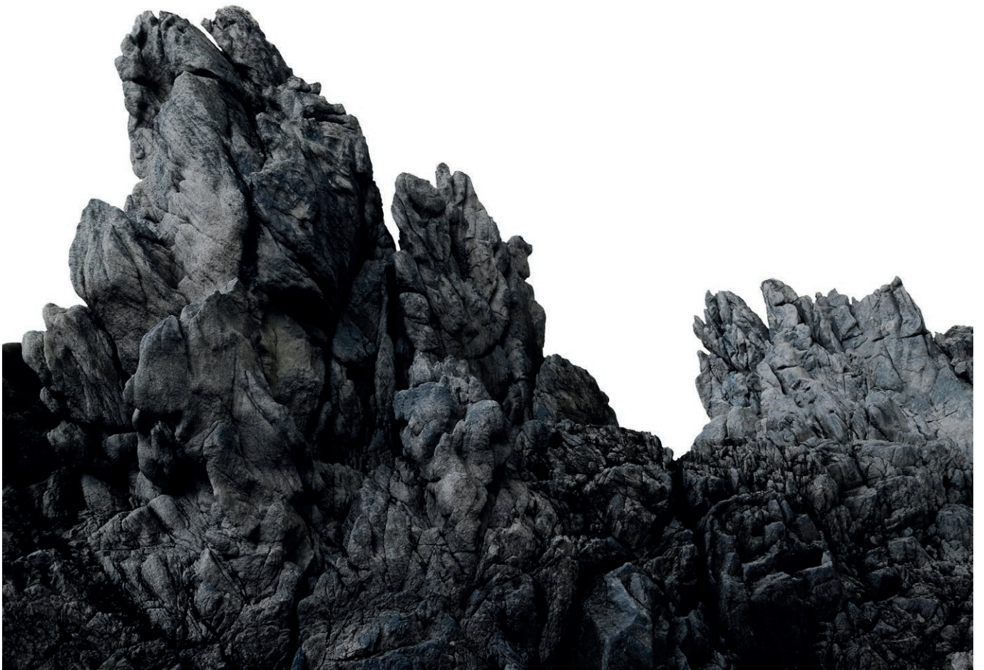
Cécile Beau Isle , 2014, Laminated print on dibond Series of seven photographs, 60 x 45 cm