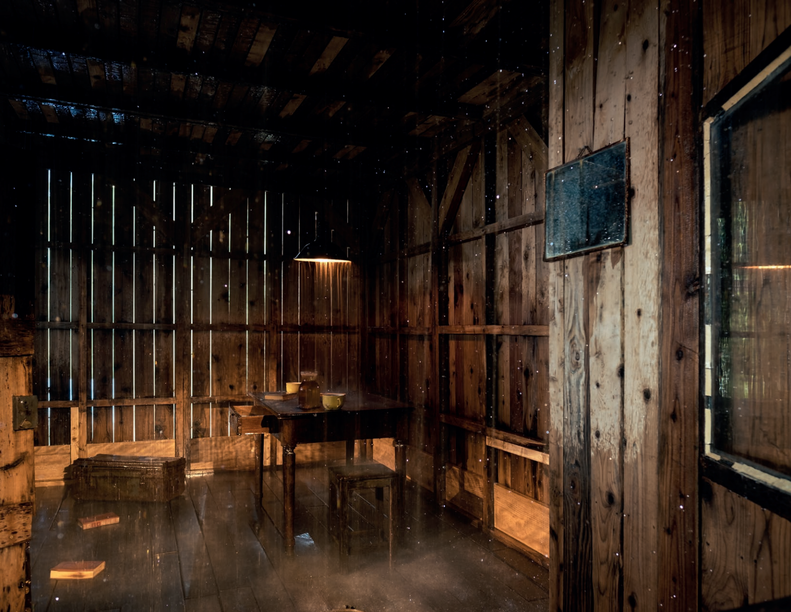
Stéphane Thidet Untitled (Le Refuge) , 2007

Les Abattoirs Musée - Frac Occitanie Toulouse collection © Adagp, Paris, 2022