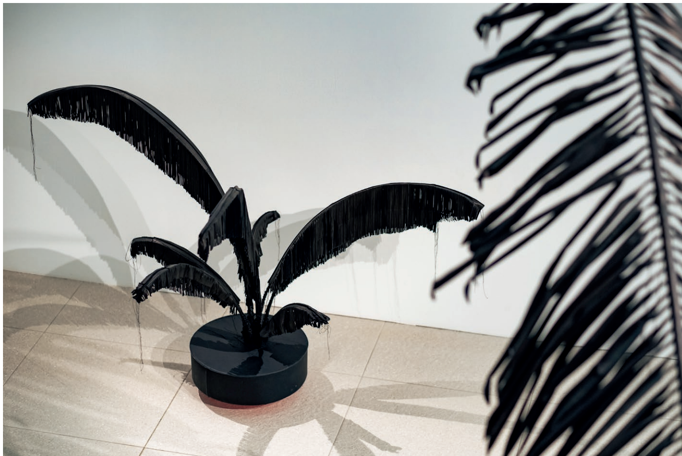
Sébastien Gouju Fougère , 2019 Leather, painted wood and steel, 102 × 157 Ø 41 cm. N° Inv. SG19004