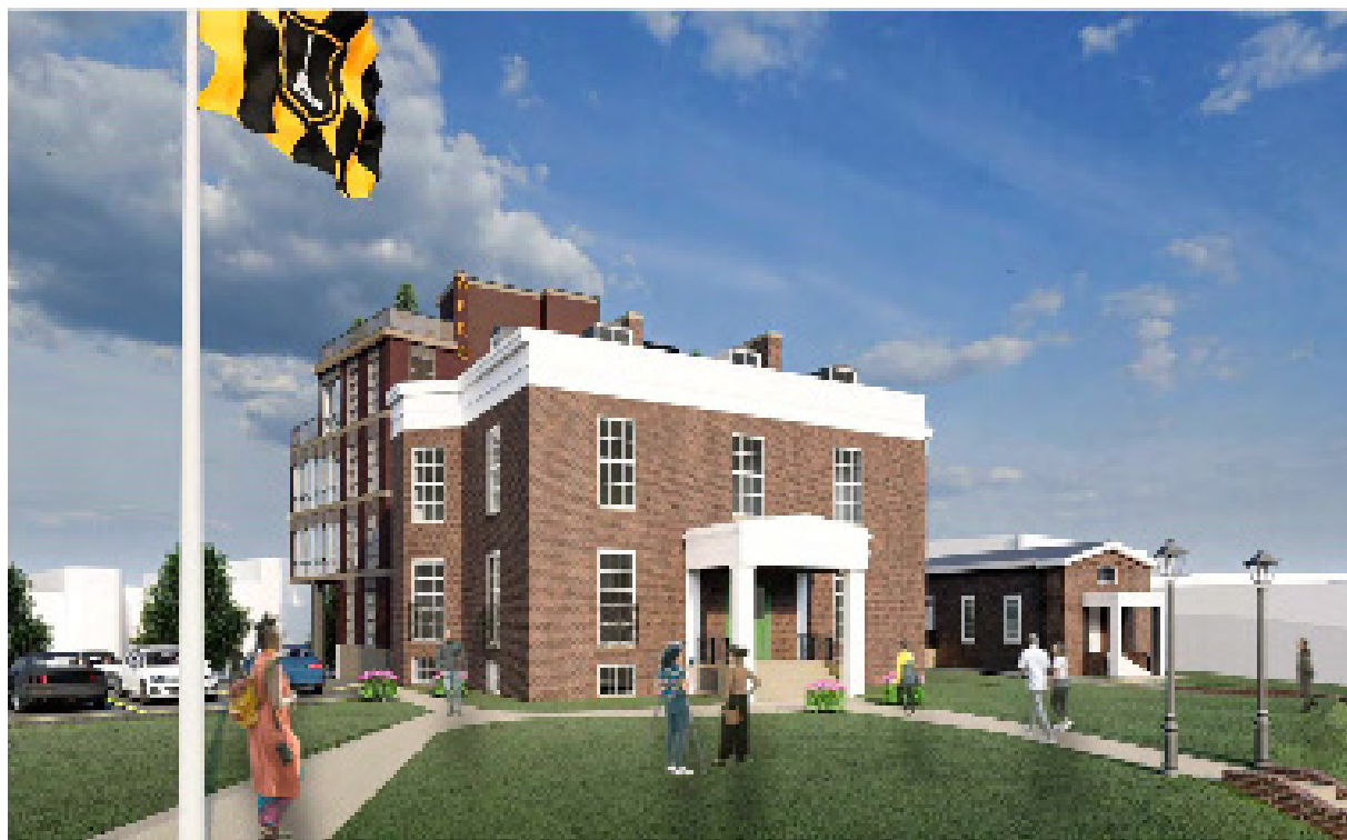
Virtual rendering of the future Afro Charities building's exterior.