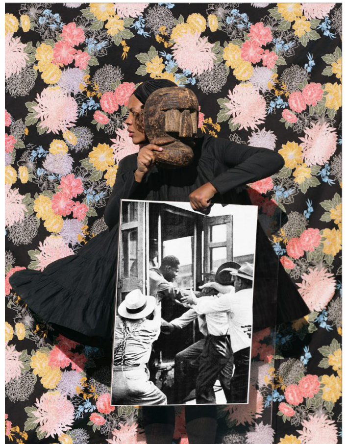
Xaviera Simmons, Sundown (Number Twenty) , 2019.