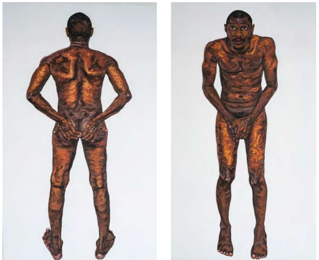
(1) Cache-cache (dyptique) , 2022, 130 x 110 cm, acrylic on canvas

By inviting to reflect on the human condition, he encourages everyone to explore the intricacies of their own existence to better understand the world around us.