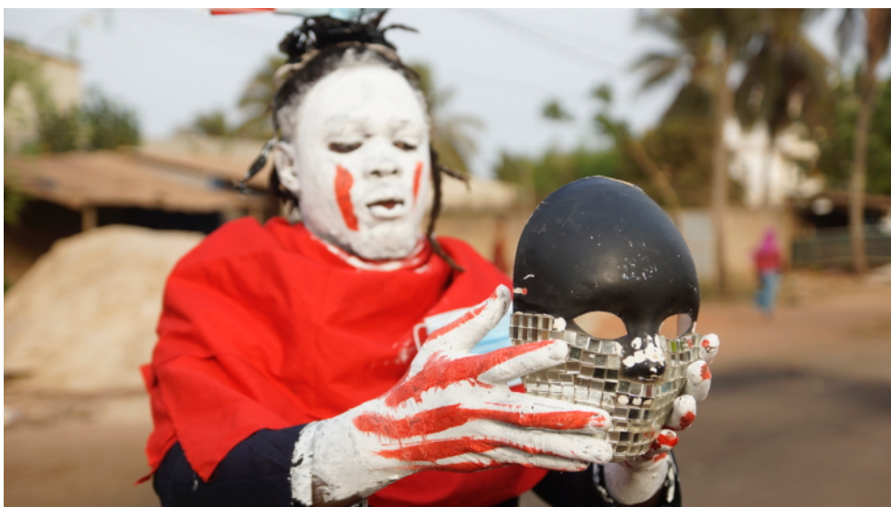
(4) Agbantè , 2021, performance, photography, 60 x 50 cm