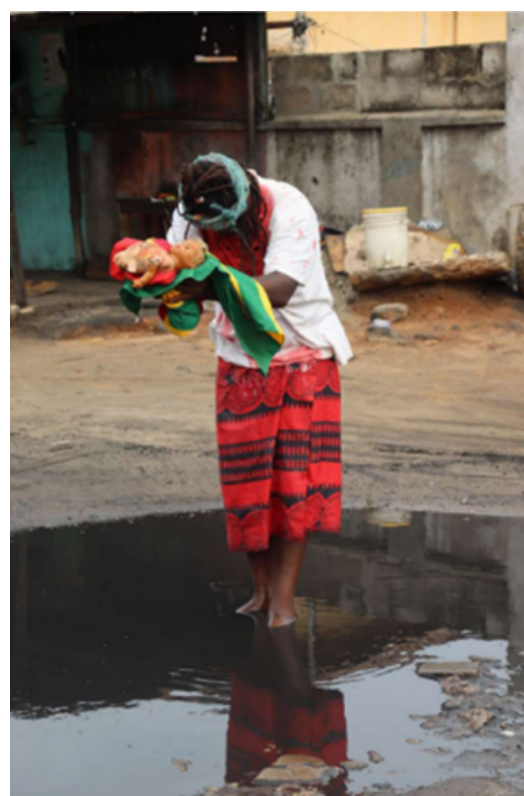
(3) Prière d'une nation , 2021, performance and installation, photography, 55 x 45 cm