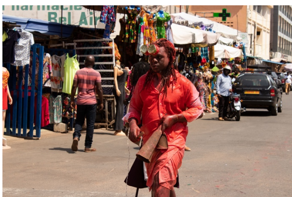
(5) Position du vent , 2022, performance, photography, 40 x 50 cm