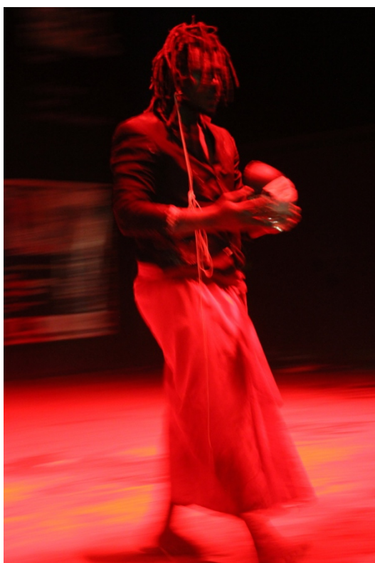
(2) Mémoire du sang , 2021, performance, photography, 55 x 45 cm

For the artist devoted to the causes he defends, it's essential to "kill the fear, resurrect courage with optimism, through photography, installation and performance". Through involved interventions, he highlights sociopolitical issues and rises debates in order to generate reactions and reflections from the population, in an open space known to all: the street. Ras Sankara is also the founder of an association gathering artists that invest themselves into social actions.