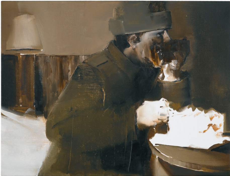
Adrian GHENIE, Hunger , 2008, oil on canvas

In the heart of the historic district of Senlis, the Fondation Francès has been showcasing the Francès collection of contemporary art since its creation in 2009. In the setting of an old Senlis house, the Fondation Francès welcomes art lovers and curious minds free of charge, and shares with them its sensitivity to contemporary creation.