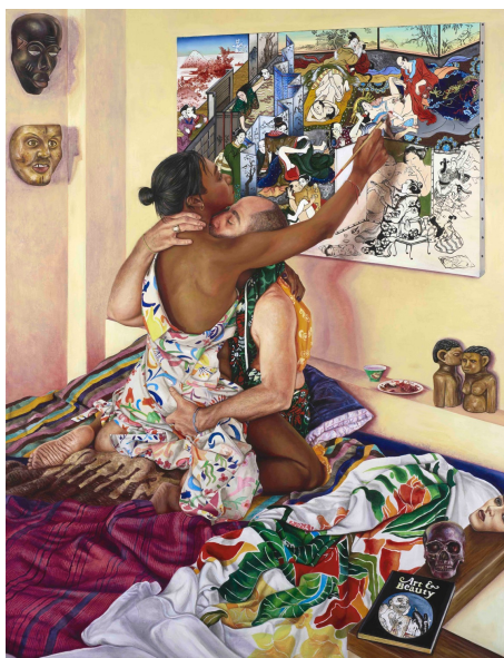
Nazanin Pouyandeh, SHUNGA #2 , oil painting, 2023 © Collection Francès

This double exhibition, entitled XXH et moi , then XXH et nous , will raise awareness, inform and inspire the public, while confirming the Fondation Francès' committed role in contemporary debates.