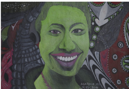
Agatoak Ronny Kowspi, sans titre , peinture sur papier, 2016

*The association Française pour l'œuvre contemporaine , founded by Estelle Francès in 2015, supports artists in their market to break their isolation.