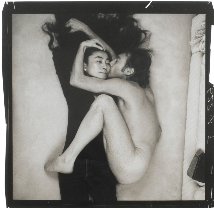
Annie LEIBOVITZ, John Lennon et Yoko One, New York 1980, 1980, platinum printing

Including the MO.CO. in Montpellier, the Museu de Arte Contemporânea in Lisbon, Portugal, Artipelag in Gustavsberg, Sweden, and the Kunsthall Rotterdam.